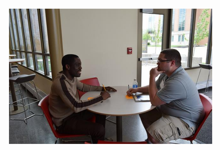
Pictured above: M.S. in Logistics and Supply Chain Management students working on a technique building exercise.